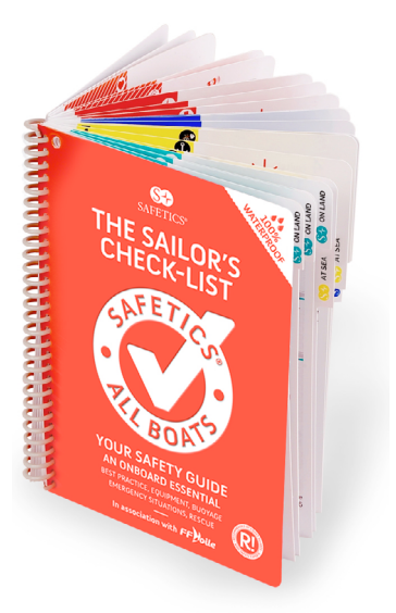
Ask us for pictures of the guide!

Its popularity continues to grow, especially among yacht clubs and companies within the nautical industry who distribute it to their members with personalised editions. The personalised versions of the guide attract clients such as boat rental companies, sailing schools, insurance companies and boat brokers. More info about Safetics <sup>®</sup> is available at www.safetics.com.